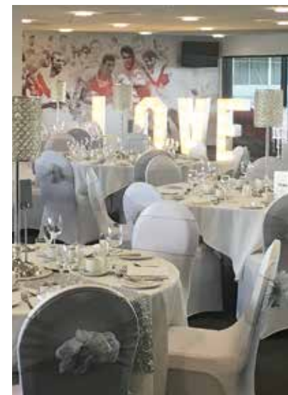
Hall of Fame

The contemporary space is also ideally suited to any theme and can accommodate up to 180 guests with its own bar and toilet facilities.