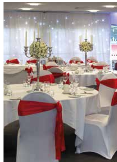
The Stapleton Derby Premier Lounge

Named after legendary former Player, Coach, Director and Chairman, the Eric Ashton Boardroom offers a truly unique and intimate setting for your event. This suite is perfect for a civil ceremony of up to 100 guests or small intimate wedding breakfast for up to 40 guests.