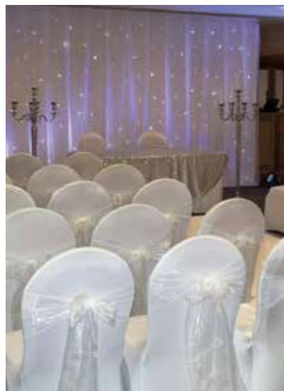
The Eric Ashton Boardroom

Named after legendary former Player, Coach, Director and Chairman, the Eric Ashton Boardroom offers a truly unique and intimate setting for your event. This suite is perfect for a civil ceremony of up to 100 guests or small intimate wedding breakfast for up to 40 guests.